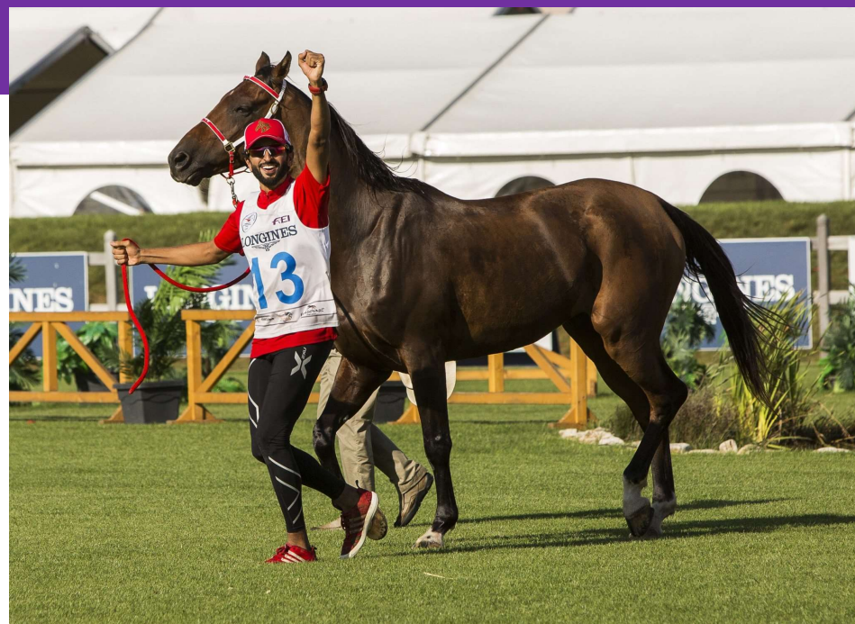
HH Sheikh Nasser Bin Hamad Al Khalifa, member of the Royal Family of Bahrain

The Royal Families of Bahrain, Malaysia, Oman, Qatar, Saudi Arabia and the United Arab Emirates will be present in Pisa for the Longines FEI Endurance World Championship 2021.